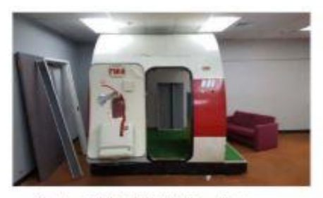
Boeing 727-231 Cabin Door Trainer

Once disassembled/removed from STL, the artifacts will then be transported back to their home in Kansas City and reassembled in the TWA Museum.