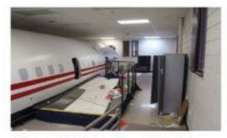
Boeing 707/727 Fuselage - Cabin Trainer

The TWA Museum at 10 Richards Road in Kansas City, Missouri is seeking volunteers to help disassemble and remove some TWA artifacts currently located in the Trans States Airlines Headquarters, 11495 Navaid Road, Bridgeton, Missouri. These items were recently donated to the TWA Museum and need to be removed from the property as soon as possible: