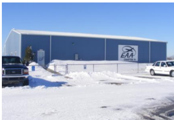
Not a scene you see too often, but yes, we had a little snow. Naturally the runways and ramps were cleared off first.