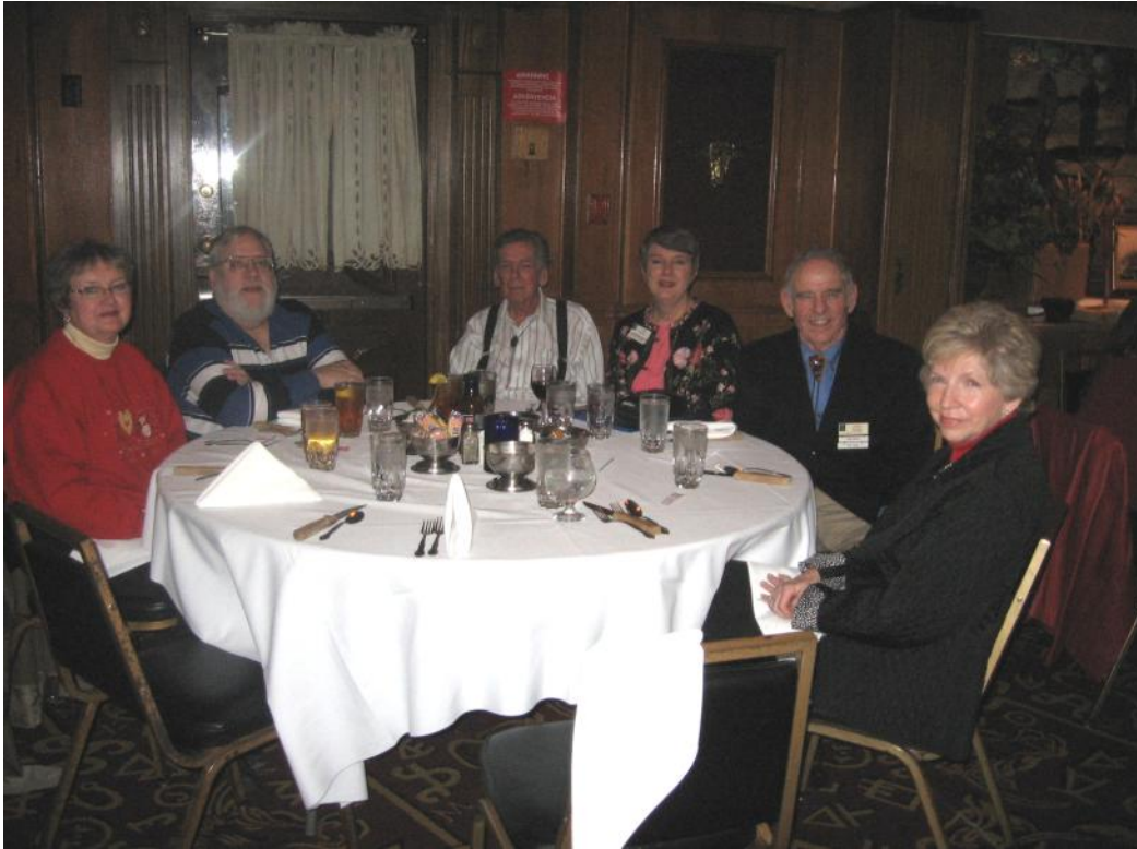
“The President’s Table”