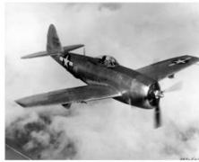
Harold Comstock November 13, 1942 P-47